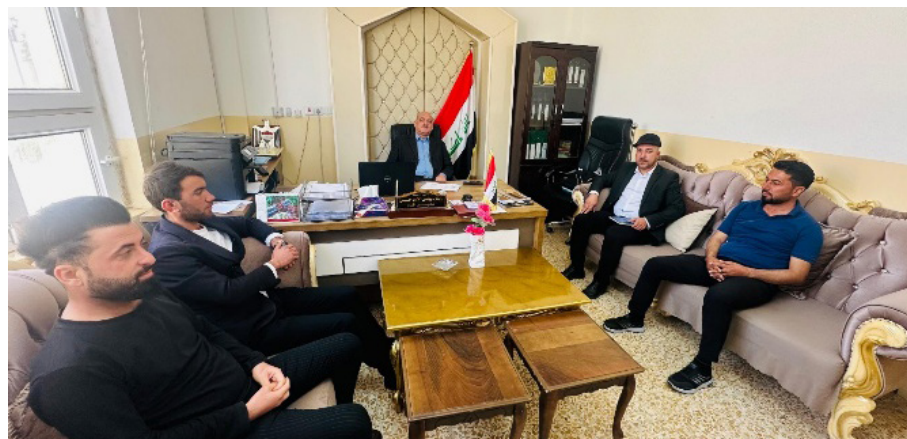
Figure 3 Meeting with Sinjar municipalities